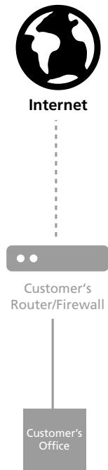
Broadband Light ("Port on the wall")